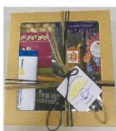
Outback Snack Box $40