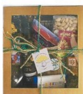
River Murray Box $75