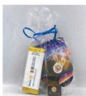
Sunset Gift Pack $25