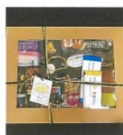
Dust Storm Hamper $105

Your Giving Back Hamper will contain a selection of the following produce: